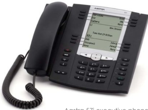
Aastra 57i executive phone